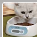
Food Grade Material