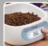
Quick View Of Feeding Quantity