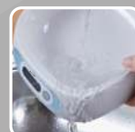
Water-proof: IPX 5